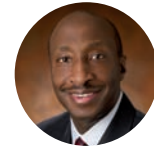
Albert Bourla Chairmand and CEO, Pfizer

“Merck’s mission is to translate science into medically important products that positively impact humanity, so it is natural for us to support the Prix Galien, since it supports exactly that.”