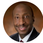
Albert Bourla Chairmand and CEO, Pfizer

“Merck’s mission is to translate science into medically important products that positively impact humanity, so it is natural for us to support the Prix Galien, since it supports exactly that.”