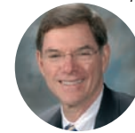
Kenneth C. Frazier Chairman, Former CEO and President, Merck

“The Galien Foundation brings together the top scientists in the world. You have Nobel Laureates across the spectrum of scientific disciplines meeting and talking with members of the pharmaceutical industry to see what’s going on at the cutting edge, because ultimately that’s going to benefit patients.”